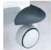
Castor with brake