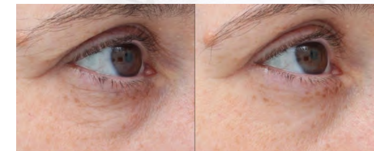
Before, and one month after 2nd treatment.

For more information please visit www.cynosure.com/TempSure