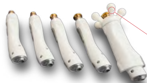
Five HP sizes ranging from 10mm–30mm Add-on feature for cellulite treatment

TempSure Envi face and body application reduces wrinkles and tightens skin* by non-invasively heating the deep layers of the dermis without damaging the epidermis. This encourages collagen contraction and new collagen formation.