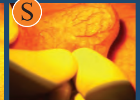
Sub-surface view USING SYRIS