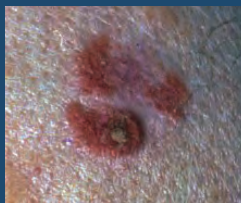
Surface view without Syris