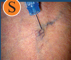
Sub-surface view USING SYRIS